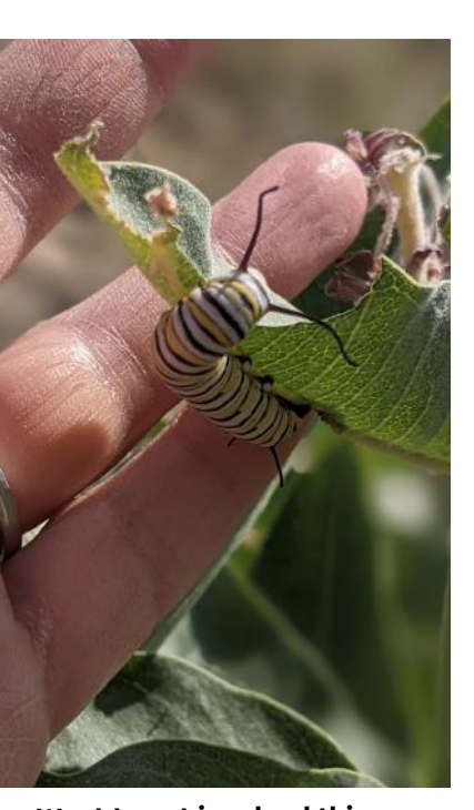
Want to get involved this summer? Contact Joel Sauder in Lewi

Milkweed plants hold a special significance for the Monarch Butterfly as they are the sole host plants for their larvae, providing vital food and shelter for their development. However, these crucial habitats are facing increasing threats from factors such as habitat loss, pesticide use, and climate change.