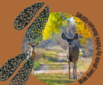
Mule deer: photo by Public Domain/USFWS