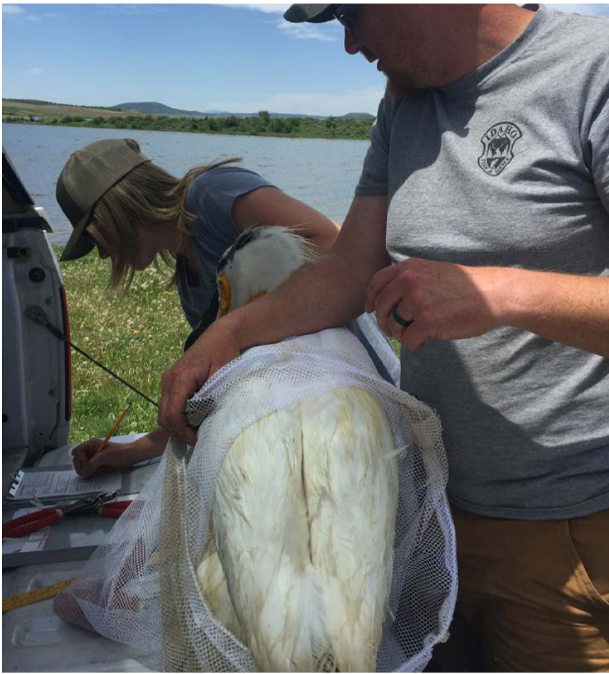
Top: IDFG staff attaching a transmitter to an adult pelican at Blackfoot Reservoir; Right: Adult pelican on Gull Island in Blackfoot Reservoir; Bottom: Flight path of one transmitter-carrying pelican from Blackfoot Reservoir to eastern Colorado.

males we caught. About half of them appeared to be nesting on Gull Island, and many of them were making regular trips of 30 miles or more to forage. Some were even commuting down to the Great Salt Lake on occasion. And one bird flew 200 miles in about 4 hours (50 miles per hour!), headed for a lake in eastern Colorado to take advantage of a good shad fishery. He would soon be joined by a couple of other transmitter-carrying pelicans who also apparently knew about the shad. Watching these birds move around the west, and south into Mexico, it has become clear that their concept of “local” is much larger than our own, and they carry with them an incredible internal map of where the safe resting waters are, and where the fish are and when.