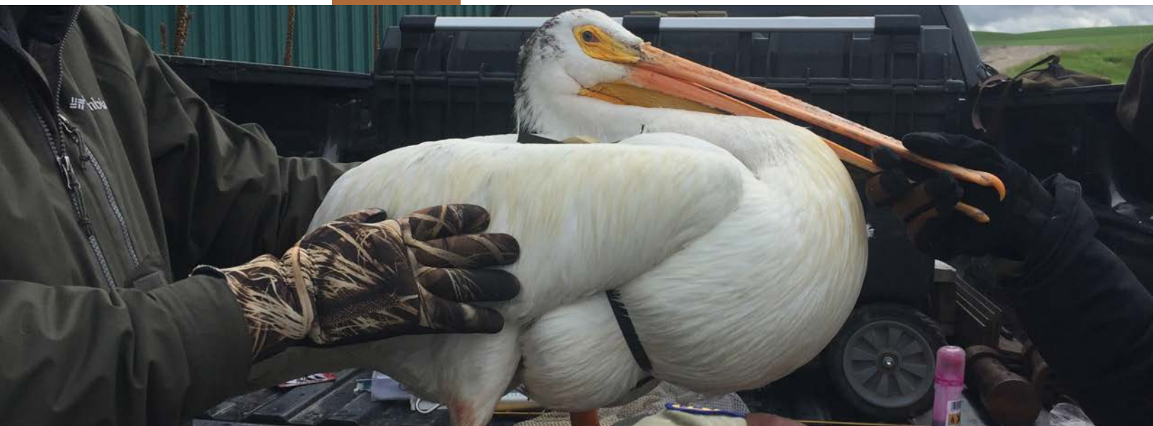
IDFG staff attaching a transmitter to an adult pelican at Blackfoot Reservoir