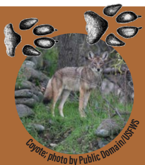
Coyote: photo by Public Domain/USFWS

Urban wildlife is all around us, but sometimes we don't actually see the animals; sometimes we just see evidence that they have been around. See how many tracks you can find around your home and neighborhood.