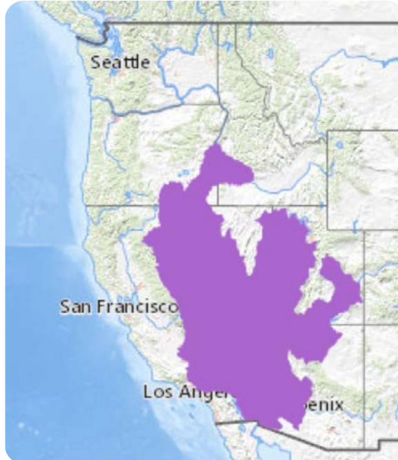
Figure 1 Great Basin Collared Lizard range map. U.S. Geological Survey - Gap Analysis Project, 2018, U.S. Geological Survey - Gap Analysis Project Species Range Maps CONUS_2001: U.S. Geological Survey data release, https://doi.org/10.5066/F7Q81B3R

In Idaho, the activity of collared lizards is limited by temperature. They are generally active during the day from April to September but might be observed earlier or later if the temperature is warm enough. They can be seen perching on