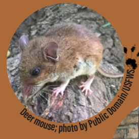
Deer mouse: photo by Public Domain/USFWS