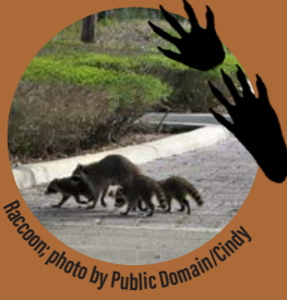
Raccoon: photo by Public Domain/Cindy