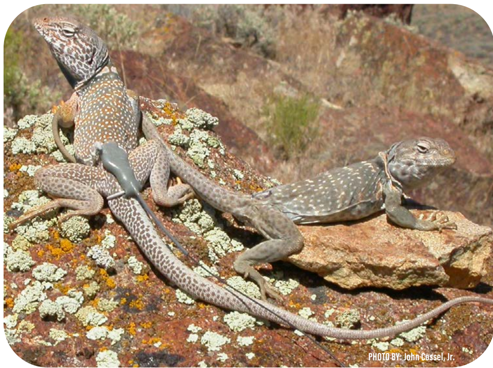
Figure 4 Female and male Great Basin Collared Lizards in Owyhee County, Idaho. The male is wearing a small radiotransmitter.

Because of their limited range in Idaho and special habitat requirements, Great Basin Collared Lizards are considered a "Species of Greatest Conservation Need." Resurveying of historical locations is needed to better determine the status and trends of this species in Idaho. Population densities of up to about two lizards per