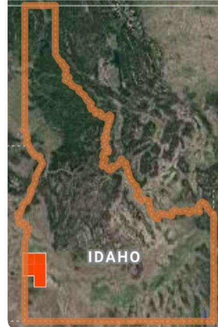
Figure 2 iNaturalist Great Basin Collared Lizard observations as of October 2020.