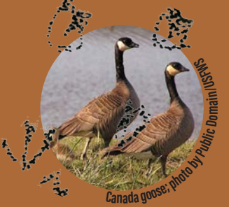
Canada goose: photo by Public Domain/USFWS