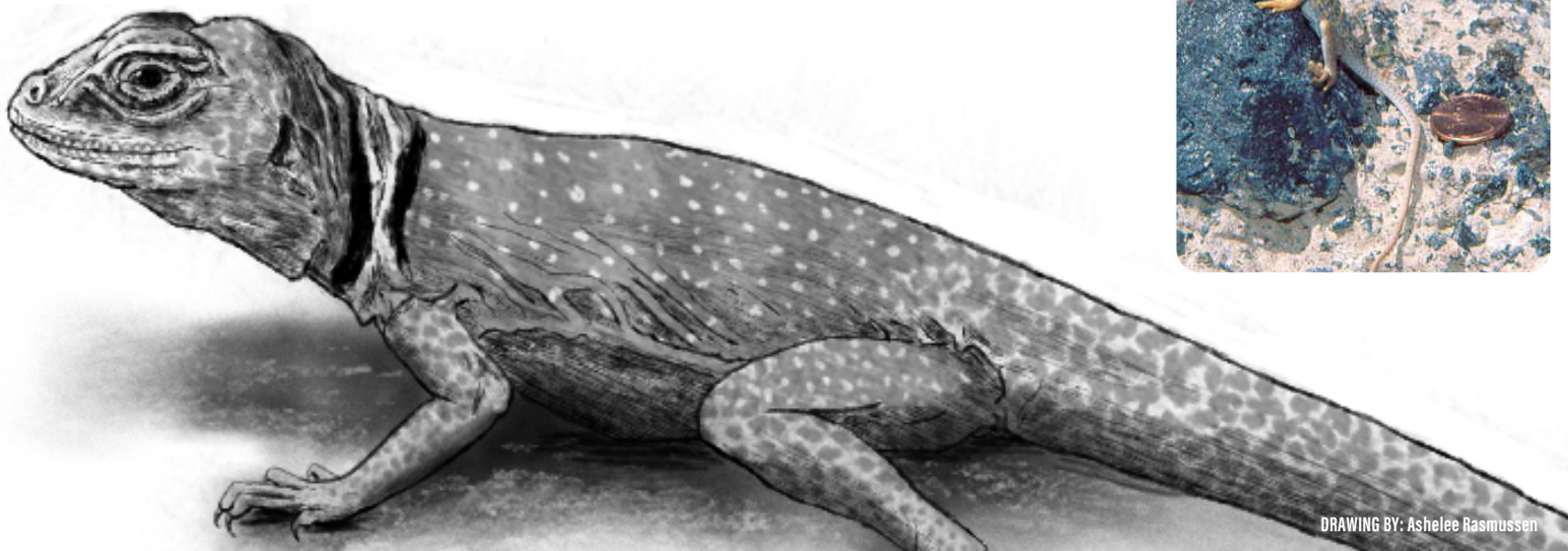
DRAWING BY: Ashelee Rasmussen