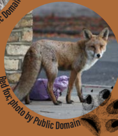
Red fox