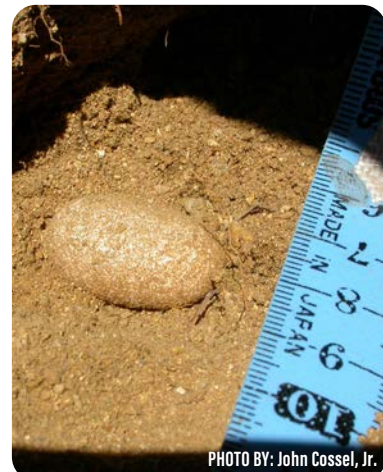
Above: Great Basin Collared Lizard egg in a burrow under a rock. Below: Hatchling Great Basin Collared Lizard.

acre have been documented in good habitat. The primary threats to this species include loss or alteration of suitable habitat by development, fire, and invasive, nonnative plants. Conversion of native shrublands to invasive grasses has probably inhibited lizard dispersal and decreased prey availability. The use of pesticides to control insects appears to have affected some populations. Past collecting for the pet trade has reduced the size of some populations. Quarrying for ornamental rocks has reduced habitat in localized areas. Hopefully by learning more about this species and taking the appropriate actions (especially habitat management), we will be able to assure its continued presence in Idaho.