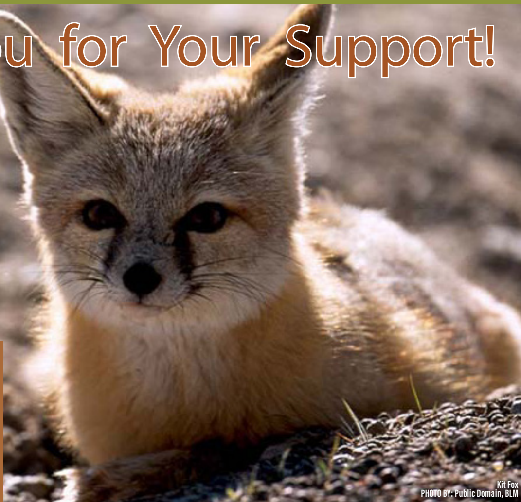
Kit Fox

Your contribution provides important funding for wildlife and habitat conservation in Idaho.