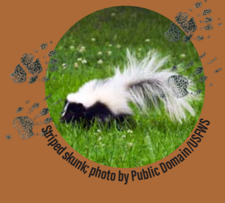
Striped skunk