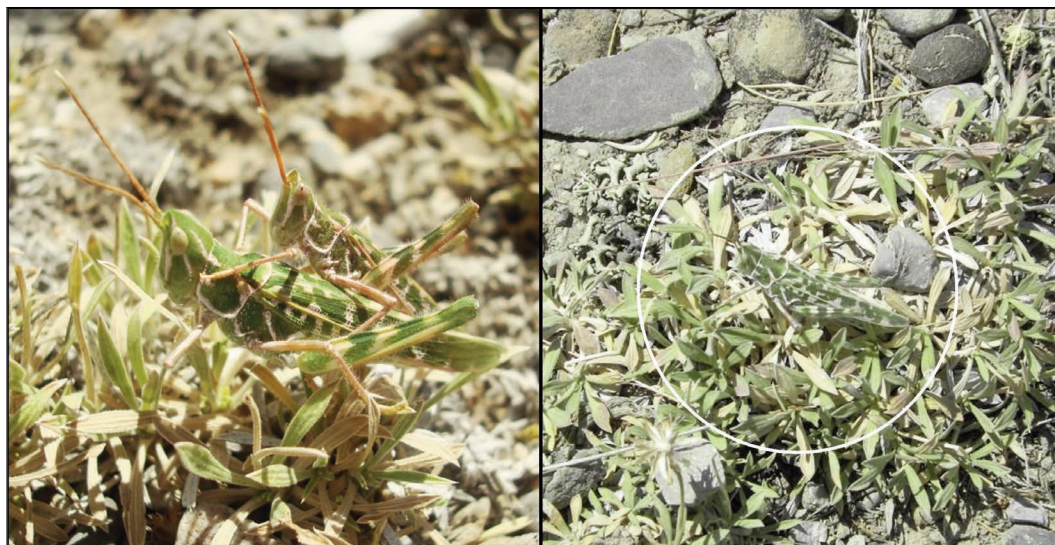
Fig. 3. Acrolophitus pulchellus detections on Stenotus acaulis (Nutt.) Nutt., stemless mock goldenweed, a common forb and possible host plant in the study area: left photo, adult female (left) and adult male (right) in copulating position; right photo, crypsis in the A. pulchellus adult female showing disruptive coloration and background matching to stemless mock goldenweed.

and grasses. Scoggan and Brusven (1972) suggested that nymphs of A. pulchellus are forb feeders. Other collectors noted that rabbit-brush (Kell et al. 1993), black sagebrush, and vagrant lichens might be preferred host plants that also offer camouflaging concealment to A. pulchellus (Baker 2003).