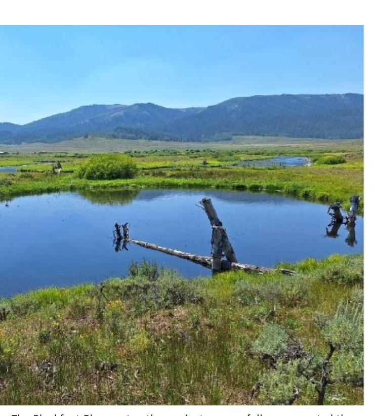
The Blackfoot River restoration project successfully reconnected the floodplain, ensuring offshoot ponds and flooded channels stay filled with water throughout the summer. This transformation has significantly enhanced breeding habitats for amphibians and created thriving spaces for waterbirds and waterfowl. The pond pictured above, once consistently dry, now flourishes thanks to the project.