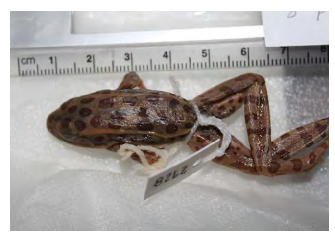
One of the last verified Northern Leopard Frog detections in the Okanogan Highlands, 2014