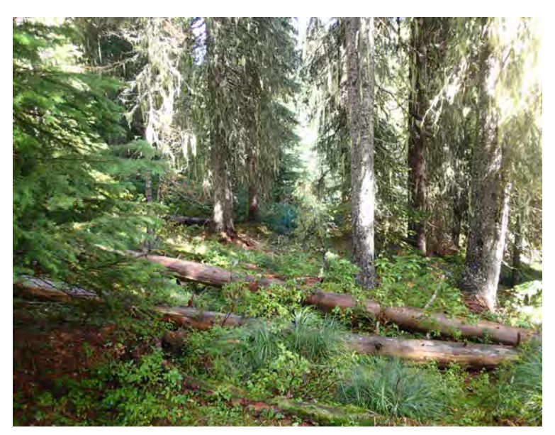
Selkirk Mountains

In the Okanogan Highlands, 30% of the land cover is classified as Mesic Lower Montane Forest. Within the Selkirk Mountains, this habitat group is located on the slopes and benches, and in valley bottoms, ravines, and canyons with high soil moisture and cool summer temperatures. Elevations typically range from 532-1,800 m. Commonly referred to as a cedar/hemlock forest, western hemlock and western redcedar are common in the overstory, with grand fir, Douglasfir, Engelmann spruce, western white pine (Pinus monticola