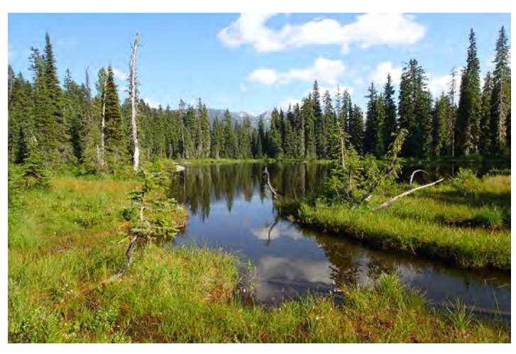
Smith Creek Peatland

Invasive & noxious weeds Invasive species often prevent the establishment of native species by forming dense monocultures and in