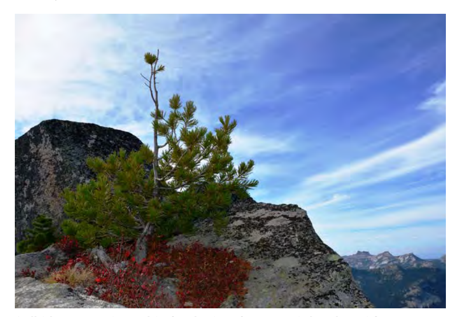
Selkirk Mountains-Whitebark Pine

(Smith and Fischer 1997). Whitebark pine replaces lodgepole pine at higher elevations and becomes dominant as the elevation and climate severity increases. At timberline, the transition zone between continuous forest and the limited alpine, only Engelmann spruce, subalpine fir, subalpine larch and whitebark pine persist. The timberline zone is impacted by drying winds, heavy snow accumulation and subsurface rockiness that