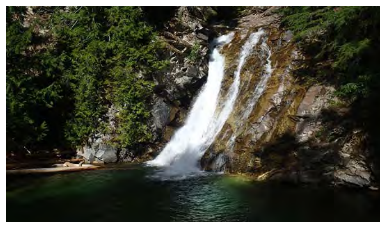
Upper Priest Falls

Drummond's willow (Salix drummondiana Barratt ex Hook.), alder (Alnus Mill.), or redosier dogwood (Cornus sericea L.) shrublands. Geyer's willow (Salix geyeriana Andersson), Bebb's willow (Salix bebbiana Sarg.), thinleaf alder (Alnus incana L.) and rose spirea (Spiraea douglasii Hook.) shrublands line lower gradient streams. Understory vegetation is a lush mix of mesic forbs and graminoids.