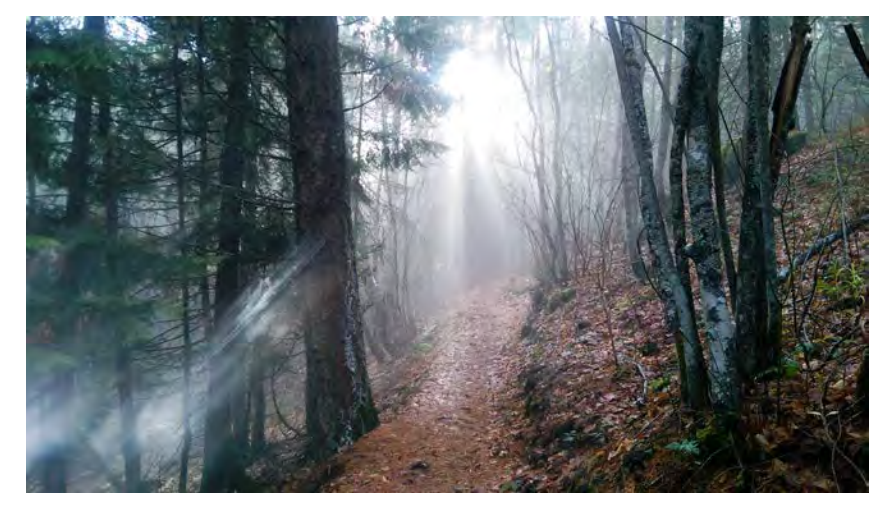
Coeur d'Alene Mountains

surround the mountain range, including the floodplain of the Kootenai, Priest, and Pend Oreille rivers and is the predominant habitat type that surrounds Rathdrum Prairie. Elevation ranges from 529 to 1,920 m in the Okanogan Highlands but there are numerous occurrences above 1,920 m. In the Dry Lower Montane-Foothill Forest, Douglas-fir is a