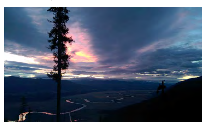
Kootenai River Valley

of wetlands and 50,000 acres of floodplain altered since the late 1800s (KTOI 2009). With grassland and farmland as the predominant habitat types, wildlife movements are likely now more relegated to narrow corridors where forests still provide cover and link the three mountain ranges. Wildlife corridors are increasing in importance as habitat fragmentation disrupts species movements and thus