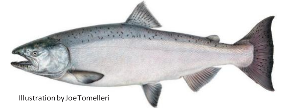
Illustration by Joe Tomelleri

Salmon in this brochure refer to anadromous (ocean run) Chinook Salmon of the species Oncorhynchus tshawytscha .