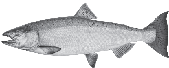
Illustration by Joe Tomelleri

Salmon in this brochure refer to anadromous (ocean run) Chinook Salmon of the species Oncorhynchus tshawytscha .