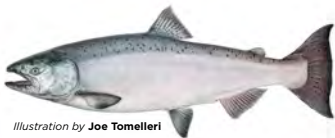
Illustration by Joe Tomelleri

Salmon in this brochure refer to anadromous (ocean run) Chinook Salmon of the species Oncorhynchus tshawytscha .