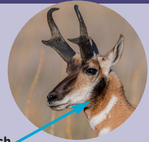
Black Cheek Patch

Buck only: Only pronghorn with a black cheek patch and with horns greater than 3 inches long may be taken during buck only pronghorn seasons.