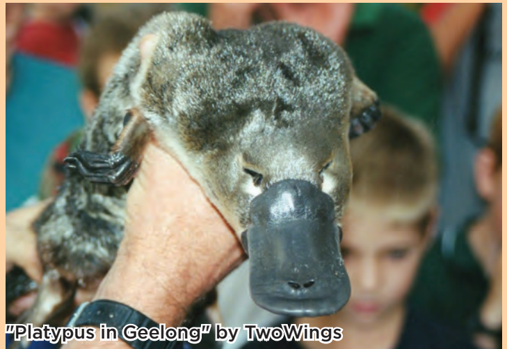
"Platypus in Geelong"

Antlers are most often used to settle differences about territory, strength and to win mates. An elk that has a large set of antlers is likely to be strong and healthy. He would be regarded highly by other elk.