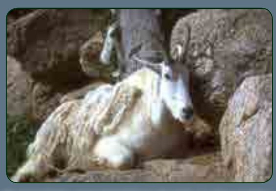
A mountain goat shedding its hair in the spring.

In the spring, animals will shed their winter hair and grow thinner summer coats. Animals often look shaggy and strange when they are shedding their long winter coats. People may even think an animal is sick. Once the silky summer hairs grow in, the animal will look good again.