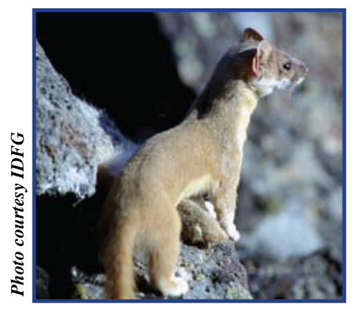
THE WEASEL FAMILY

Members of the weasel family are called mustelids (mus-TELL-ids). In Latin, "mustela" means weasel. This group of animals includes wolverine, badger, fisher, weasels, pine marten, mink, and otters. In Idaho, we have eight species of mustelids.