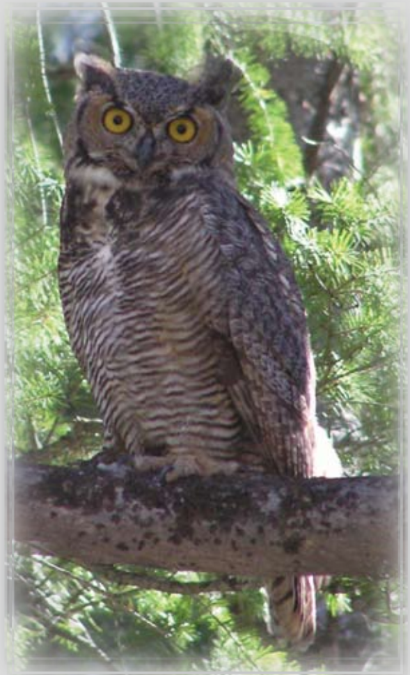
Great horned owl

Northern Pygmy Owl: "toot, toot, toot, toot, toot, toot"