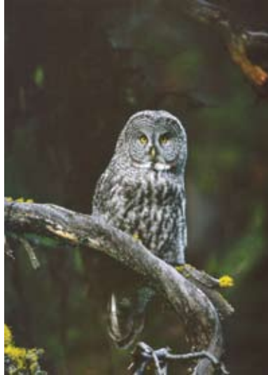
Great gray owl

Because owls have big eyes, you might think they hunt by sight. Amazingly, owls hunt mainly by sound. Could you find your dinner by listening for it?