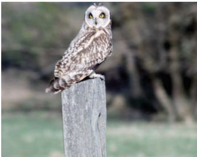
Short eared owl

So, why are these owls out at different times of night? Many owls share habitats so being active at different parts of the night might help reduce competition between the different kinds of owls. In addition, different kinds of prey species are active at different times of night. If an owl was strictly nocturnal and its prey was crepuscular, that owl will not be able to find its food. Owls need to be able to hunt at the same time that their food is active to make sure that they get dinner!