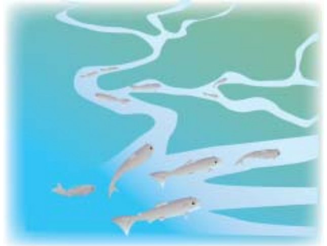
Returning steelhead smell their way home.

Once home, these fish will spawn and continue the cycle all over again. Most will die after spawning but remember, some steelhead, unlike their Pacific salmon relatives, will survive to make one more journey to the ocean.