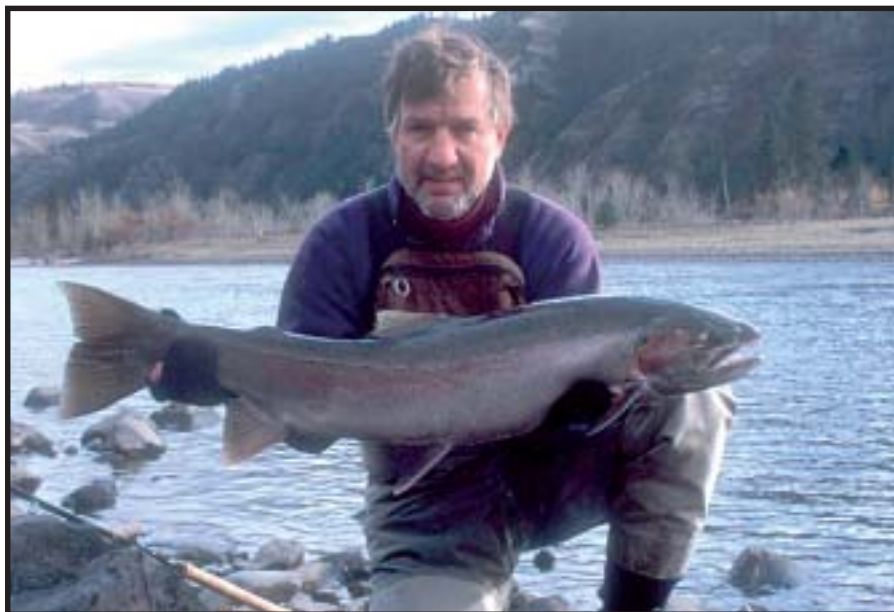
Fisherman with a "B" run steelhead.