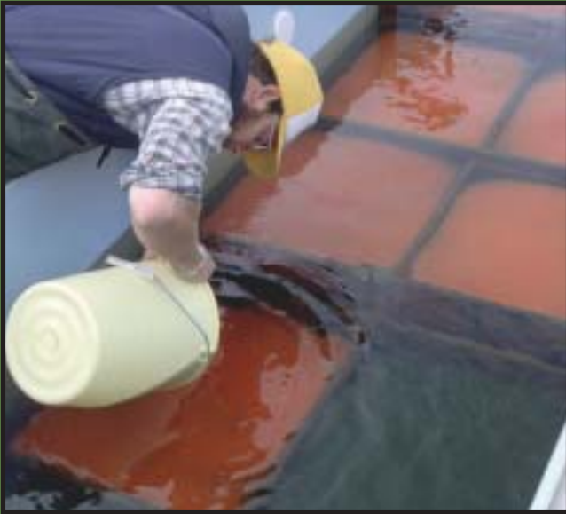
Hatchery worker tending to steelhead eggs