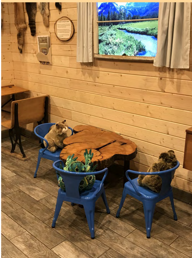
A tea party in the Hunting Cabin.