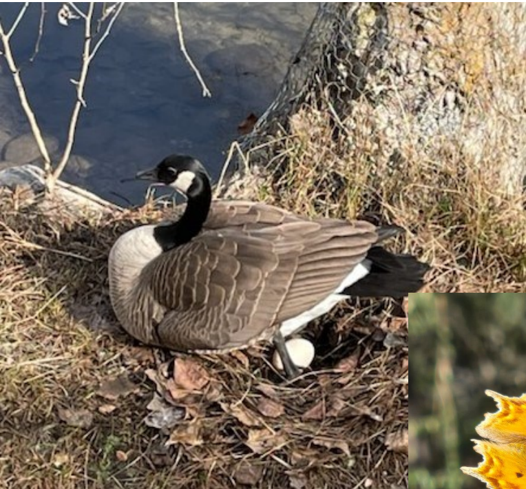
Canada goose laying an egg!