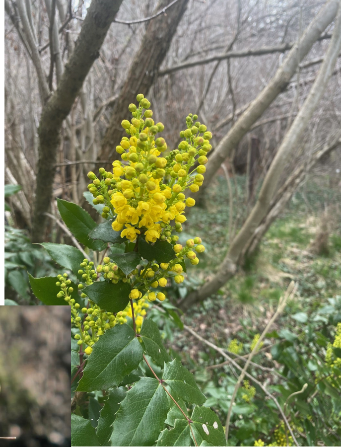
Oregon grape starting to bloom.