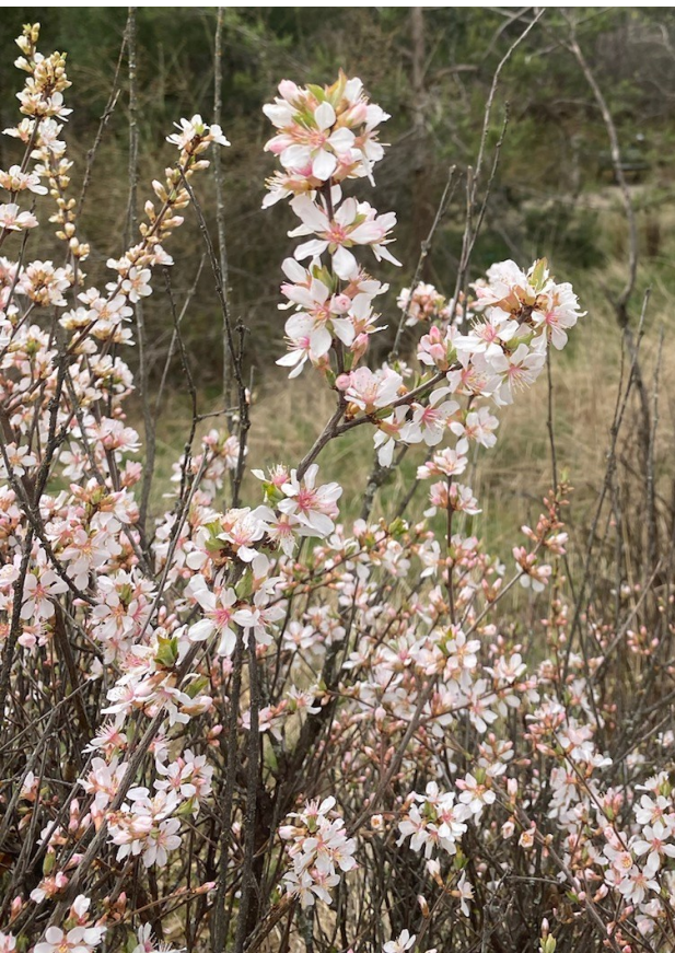
Left: Prunus sp. In full bloom. Right: Western Larch needles budding.