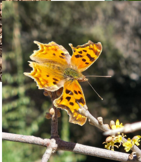
Comma.