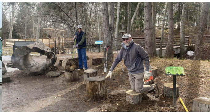
Stepping stumps ready to be placed. Thanks for your donation, Idaho Tree Preservation!!