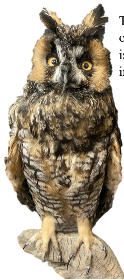
The long-eared owl, whose name is extremely inaccurate.