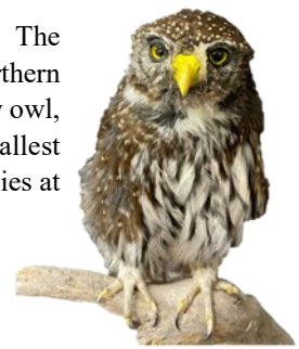
The northern pygmy owl, our smallest species at