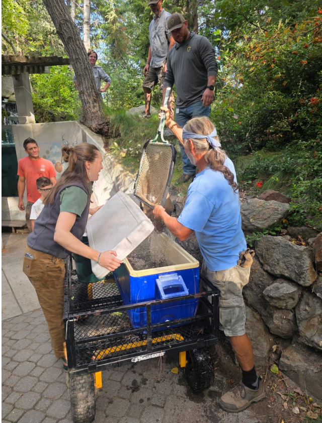
Staff and volunteers unload the sockeye salmon from the cooler to the pond.

On September 11th, five Columbia River sockeye salmon were stocked at MK Nature Center from the Eagle Hatchery. This marks our third year getting these beautiful fish for fall viewing. Columbia River sockeye salmon are from a distinct population, separate from the Idaho native Snake River population. Though visually identical, their genes are different! Eagle Hatchery manages the endangered sockeye brood stock program and when they identify a Columbia River fish in their midst, they do not breed those fish with the Idaho population. What better place to put them to live out their lives than the MK Nature Center? Come see them spawn and die in our large outdoor viewing window this fall!