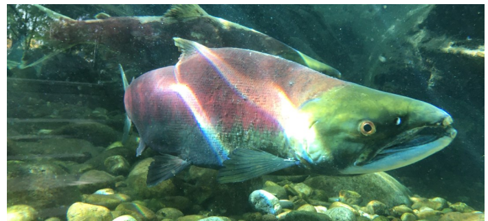
Sockeye salmon in the MK Nature Center viewing window.