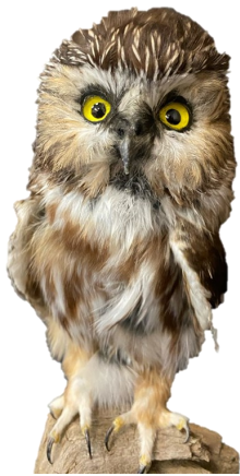
The saw-whet owl, possibly the cutest of all Idaho's owls.

The "HOO Lives in Idaho" program helps students understand the unique features of owls compared to other raptors, allows students to look inside an owl pellet, and learn about the different adaptations and sounds of our 14 species of owls in Idaho. It turns out, owls don't all say "hoo," hunt at night, and eat mice! There is so much to learn about each species!