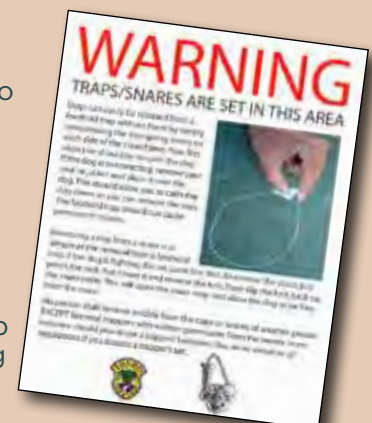
The sign is a courtesy of Idaho Fish and Game in cooperation with the Idaho Trapper's Association.

Trappers are encouraged to use warning signs to inform recreational users that traps or snares are in the area. Trappers may print off copies of the signs from idfg.idaho.gov and post them near their trap lines. Using warning signs is voluntary.