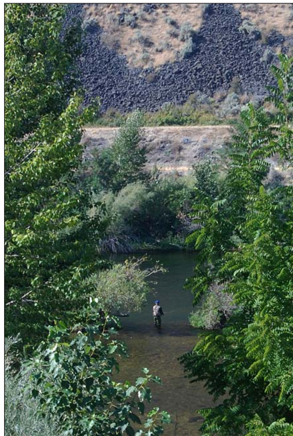
Nearly half of Fish and Game's revenue comes from license and tag sales, like from this angler.

The potential funding mechanisms for wildlife management are as diverse as the states and their wildlife.