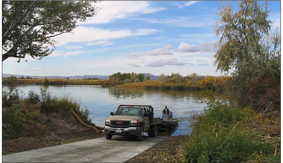
This boat ramp on the Snake River is one of many maintained by Idaho Fish and Game.

Dingell-Johnson grants require a 3:1 match with nonfederal money – that means for every $1 Fish and Game spends on fish management, the U.S. Fish and Wildlife Service pays $3 for the same