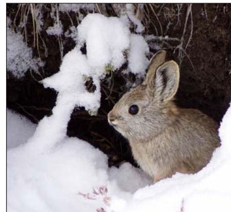
Pygmy rabbit

Idaho Fish and Game is responsible for about 10,000 species of fish, wildlife and plants. About 550 are vertebrate animals, 80 percent of which are classified as “nongame wildlife.”