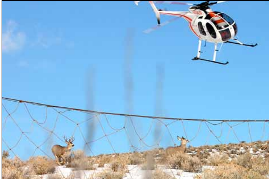
Mule deer are driven into capture nets in a research project.

When the habitat is near its capacity to feed the deer population, more animals are likely to be in poor health. Reducing one source of mortality will simply result in an increase in another source, such as starvation, with no net decrease in total