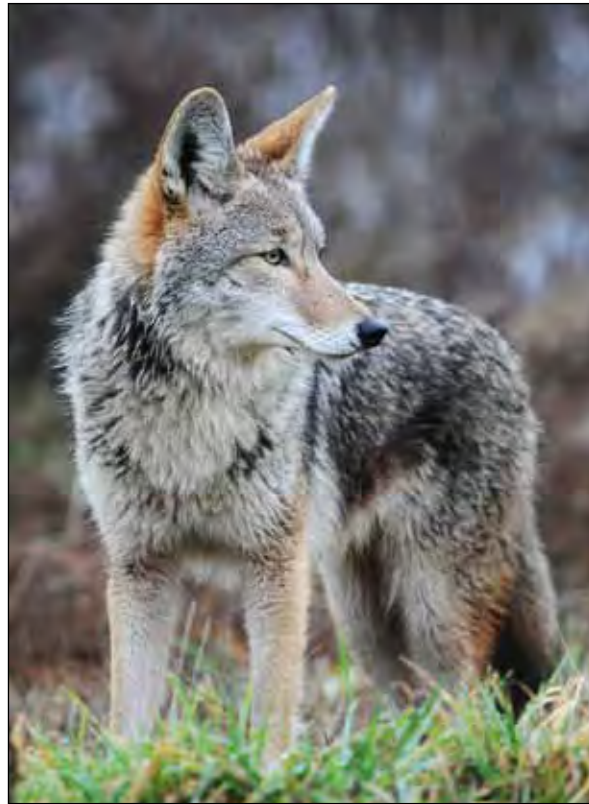
Coyote - Canis latrans