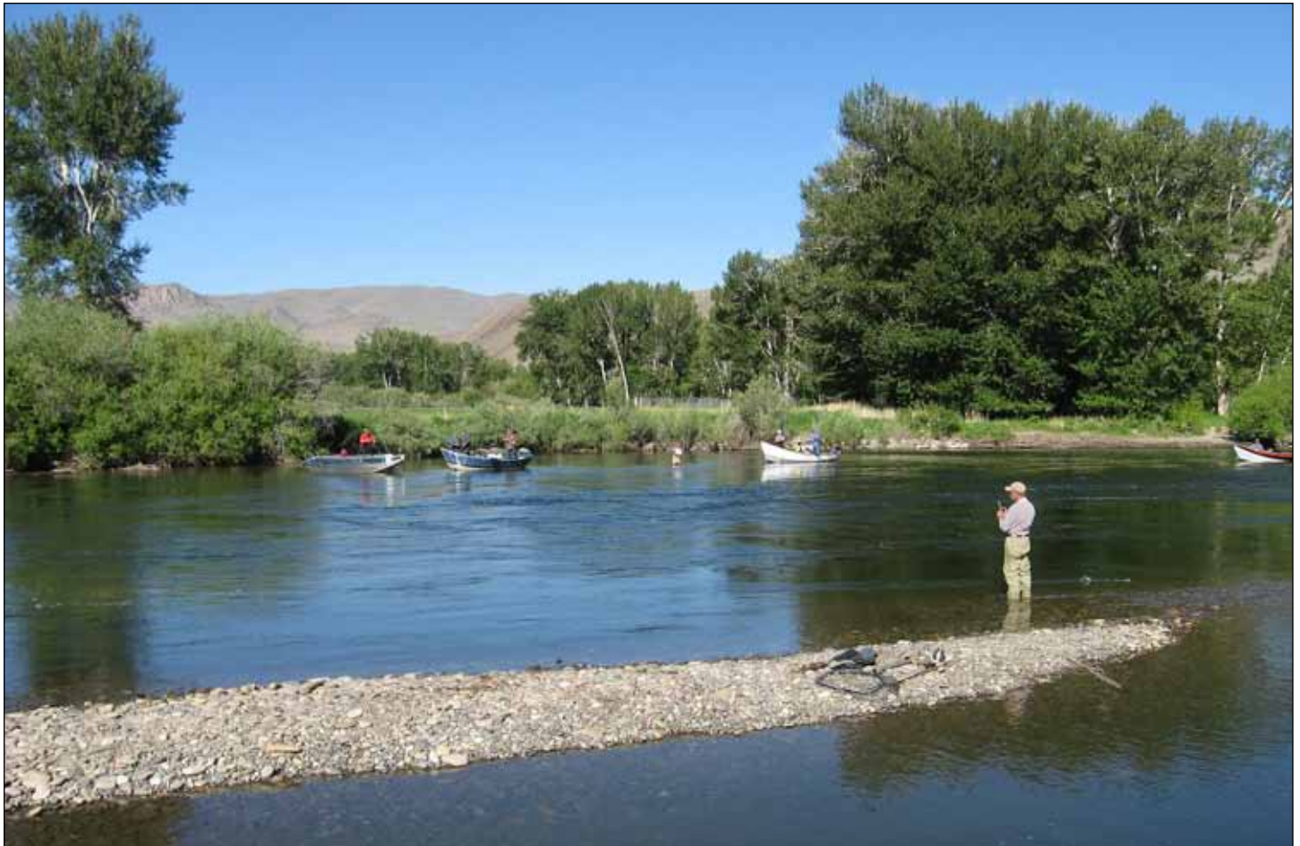
Summer, salmon and fishable conditions eventually arrive on the upper Salmon River.